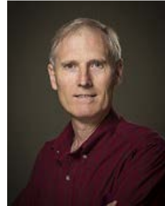
Ross Lyle Chair Mechanical Engineering